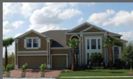
Lot 268 - The Sycamore