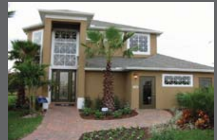
Lot 235 - The Alicante