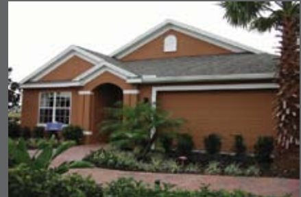
Lot 233 - The Medici