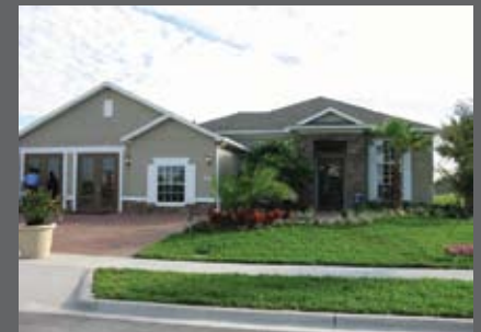
Lot 266 - The Laurel Oak