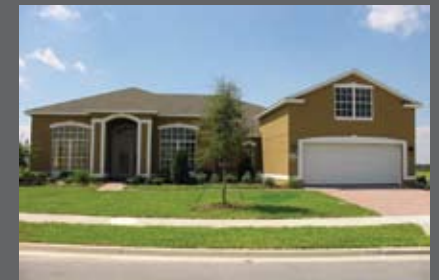
Lot 93 - The Laurel Oak